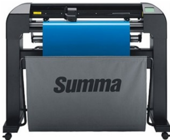
Plotter Summa S75-T

use tangential technology. This technology reaches more fine detail, accuracy on fonts, better quality and wider opportunities to cut through very thick and harder materials.